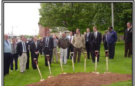
City and State officials gather on site for the groundbreaking ceremony.

Besides fixing a safety problem in the City, the project plans call for creation of a pocket park and other streetscape treatments designed to