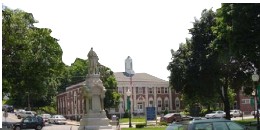
Southington Town Hall